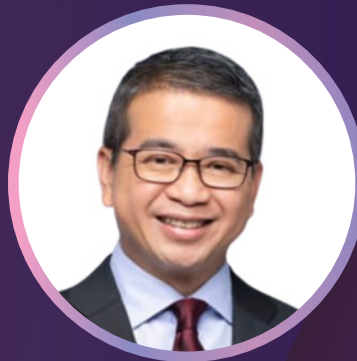
MR EDWIN TONG SC

Minister for Culture, Community and Youth and Second Minister for Law Ministry of Culture, Community and Youth & Ministry of Law (Singapore)