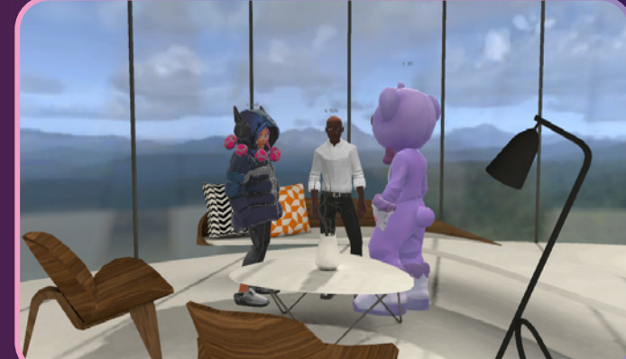
*Terms and conditions apply