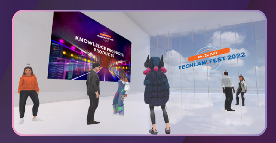
EXPLORE the numerous technology and solution showcases within the metaverse